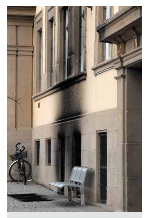
Extensive damage to the building structure. Closed 8 months for certificate (statics) and renovation.

made to control and extinguish the fire. Deployment for those entrusted with the extinguishing work is difficult and extremely dangerous. Intense, highly toxic smoke enters the emergency exits, visibility is guite obscured. In a flashover even the most highly modern protective systems of fire brigades hold the extremely high temperatures throughout the building at bay for just a few seconds. The results of such fires are in every respect incalculable, both for the user as well as for the operator of the car parks, and not least of all for the environment. Many of these car parks are located in inner cities; a fire can have catastrophic consequences for the surrounding area.