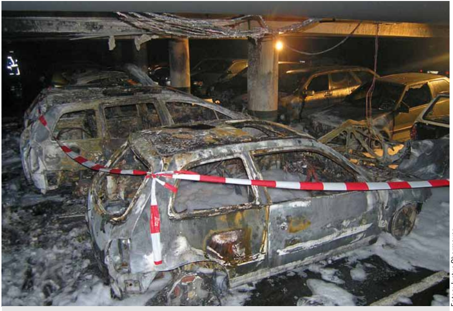
In April 2008 there was a fire in the underground car park in Wehr/Baden with nine completely burnt out passenger vehicles.

There are a high number of parked vehicles in car parks being utilised and the fire load is immense. Highly flammable materials, such as plastic, rubber, textiles, have been used in the vehicles' production - all of which have a high potential for fire development and smoke production. In addition, passenger vehicle tanks are filled with combustible fuel. Fire quickly develops through negligence (discarded lit cigarettes or carelessly placed highly flammable materials coming into contact with the hot motor components of the parked passenger vehicles) or through a technical defect (faulty power cable, leaky petrol lines or tanks, new electric power systems with increased dan-